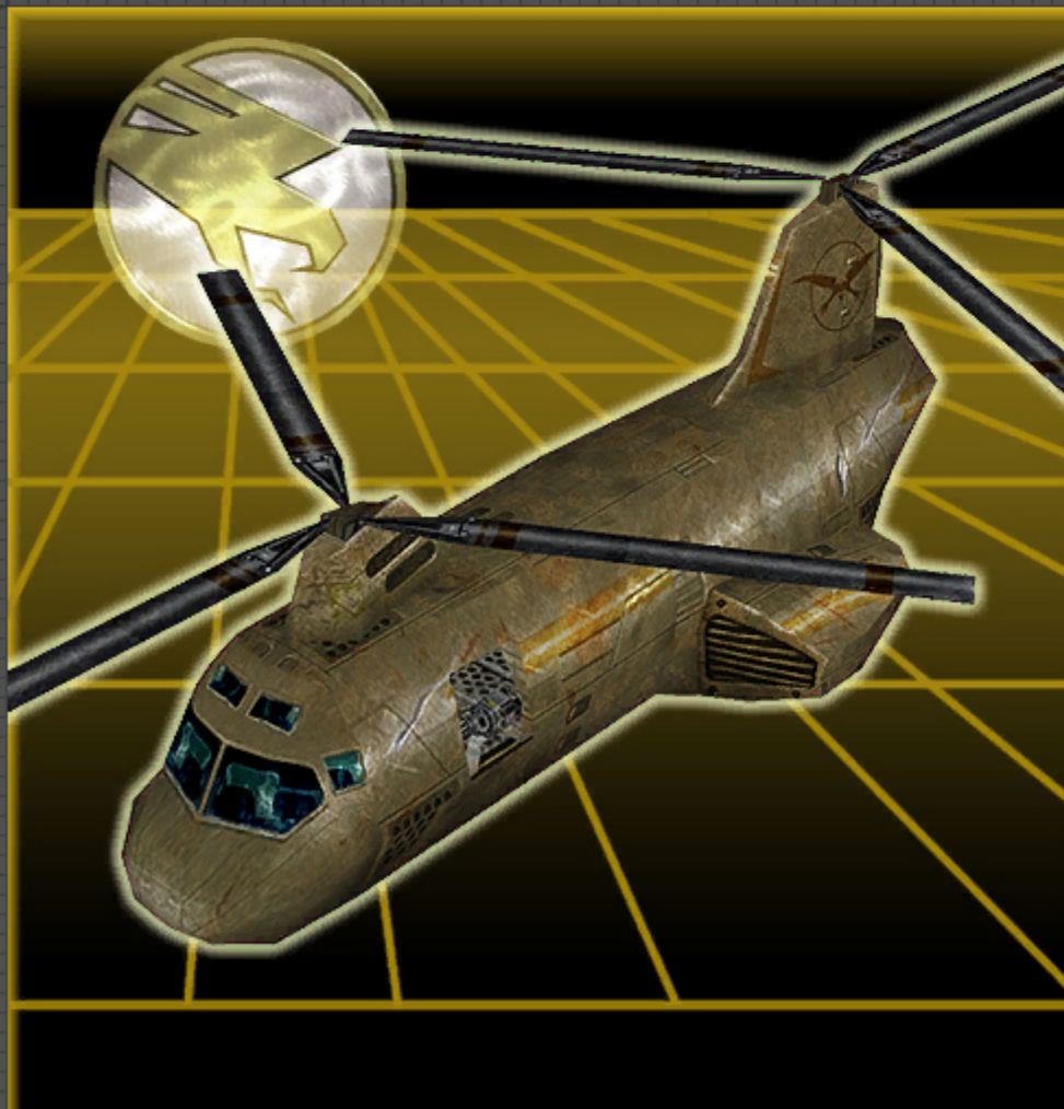
Ps hud_cnc_gmobiusion2.dds @ 100%