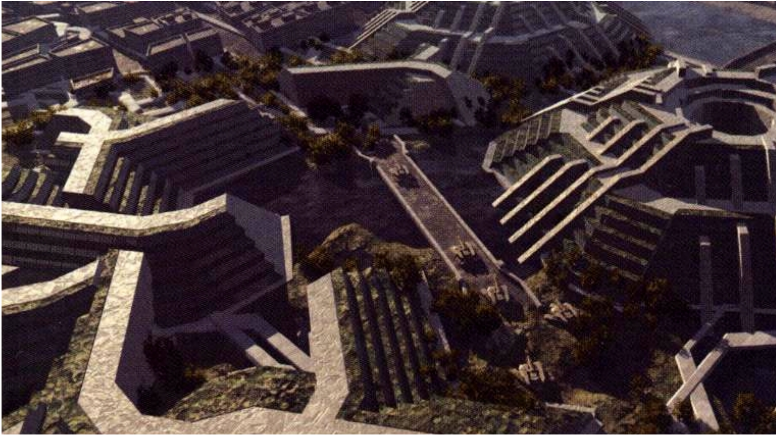
9) cnc3_09.jpg , downloaded 1002 times