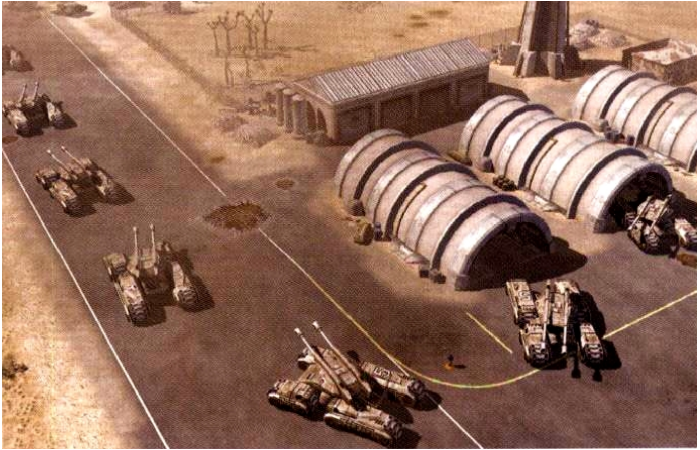
6) cnc3_06.jpg , downloaded 1026 times