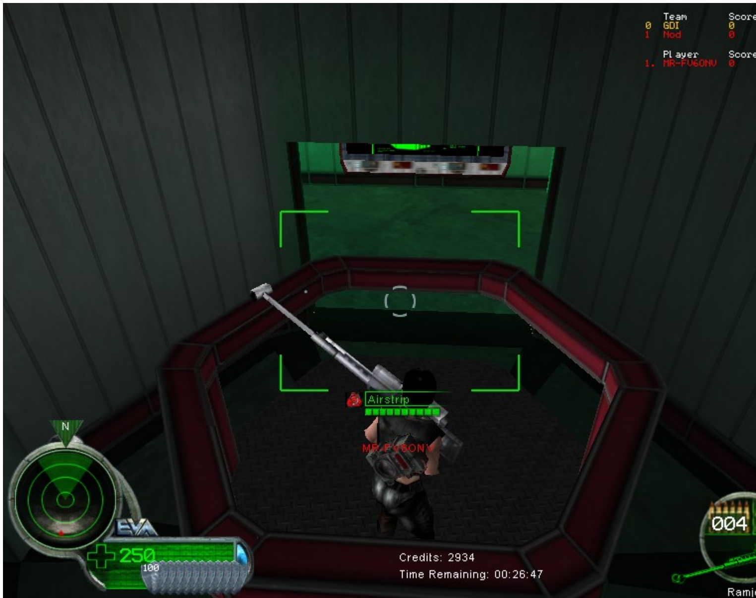
6) ScreenShot03.jpg , downloaded 709 times