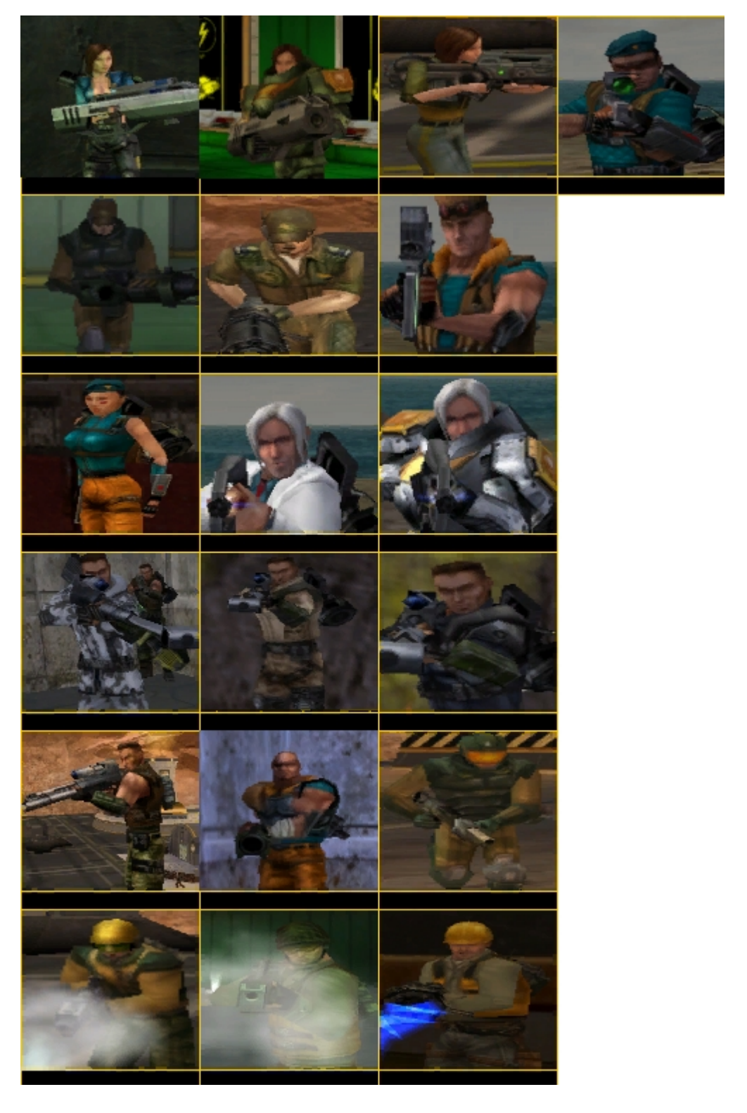
6) NodChar.jpg, downloaded 385 times